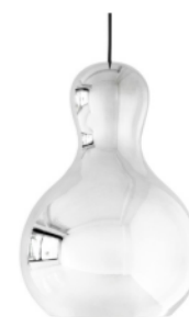
P3 SILVER CHROME