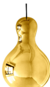
P3 GOLD CHROME