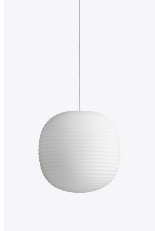
Lantern Pendant, Large (Ø 400 mm)