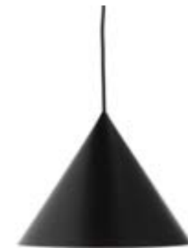
ø20 cm. Matt black: art.no. 100461 ø46 cm. Matt black: art.no. 100542 Black fabric cord