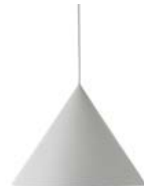
ø20 cm. Matt white: art.no. 100464 ø46 cm. Matt white: art.no. 100546 White fabric cord