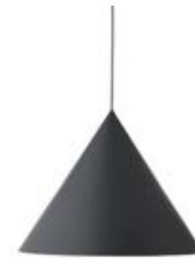
ø20 cm. Matt grey: art.no. 100460 Grey fabric cord