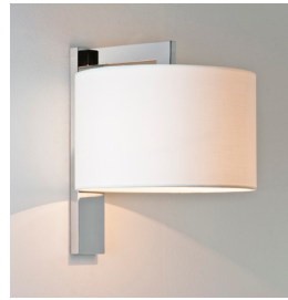
CODE: 1222012 FINISH: POLISHED CHROME