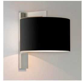
CODE: 1222013 FINISH: MATT NICKEL