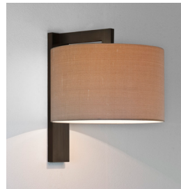
CODE: 1222040 FINISH: BRONZE

TO MAINTAIN THIS PRODUCT TO ITS BEST CONDITION, PLEASE VIEW OUR CARE AND CLEANING GUIDE ON THE SUPPORT SECTION OF THE ASTRO WEBSITE.