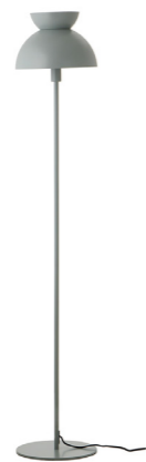
Pale Green Matt Art. No. 127715