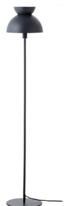
Steel Blue Matt Art. No. 127709