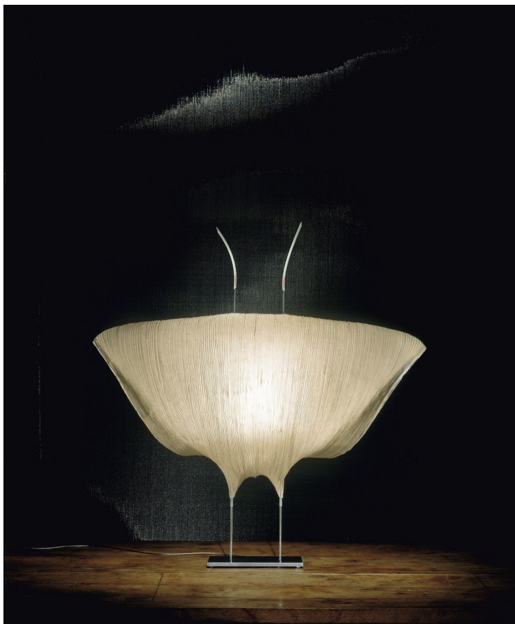
Samurai DAGMAR MOMBACH, INGO MAURER & TEAM 1998

Paper, metal, stainless steel, silicone, glass, glassfibre shades. Samurai LED is equipped with a dimmable LED module. The module was developed by Ingo Maurer GmbH especially for the MaMo Nouchies. The light is warm and soft, and can hardly be distinguished from conventional halogen light. In contrast to the halogen version shown in the photos, the cable is visible, as with Poul Poul.