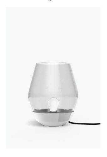
Stainless Steel w. Light Smoked Glass