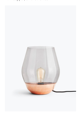
Raw Copper, Smoked Glass