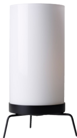
OPAL GLASS WITH BLACK LACQUERED STEEL BASE