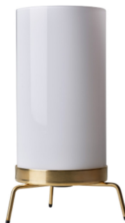
OPAL GLASS WITH UNTREATED SOLID BRASS BASE