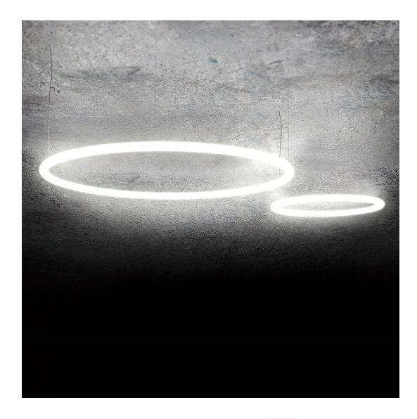
IP20 🛓 🔣 🧲 Dimmerable: +O-