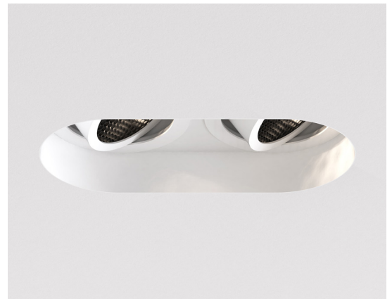
CODE: 1248021 FINISH: MATT WHITE

TO MAINTAIN THIS PRODUCT TO ITS BEST CONDITION, PLEASE VIEW OUR CARE AND CLEANING GUIDE ON THE SUPPORT SECTION OF THE ASTRO WEBSITE.